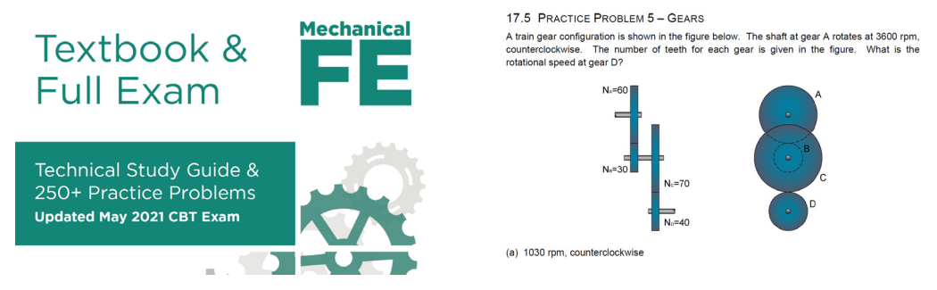
(Screenshot of textbook cover and textbook practice problem)

You will receive your hard copy textbook in the mail. Shipping is included in your course cost. You will also receive an electronic copy (PDF) of the textbook as well. Please follow the schedule and read the appropriate chapters in the textbook. The practice problems in the hard copy textbook are on the easy to medium level of difficulty.